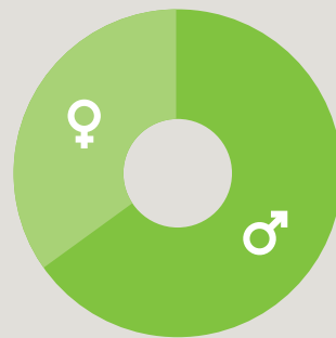
Lower Middle M 65.01% F 34.99%