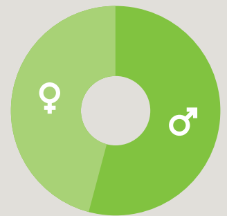
Lower M 53.98% F 46.02%