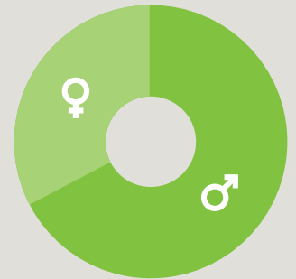
Upper Middle M 67.23% F 32.77%